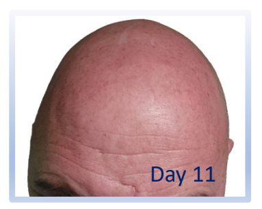
Head Laceration | Closure Series